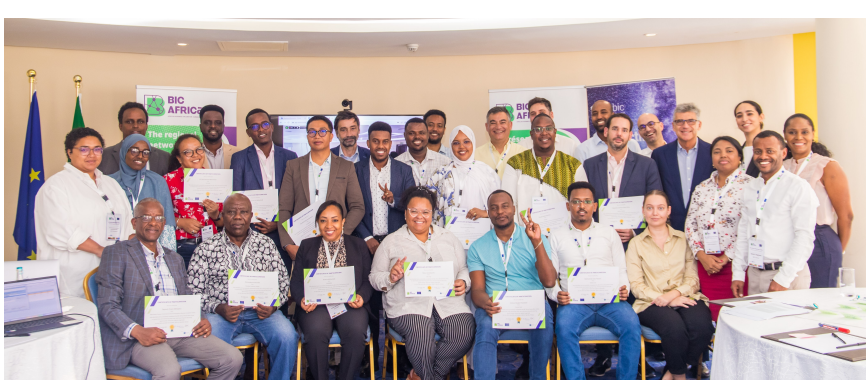
BIC Africa Kenya Boot Camp: Impactful Dialogue

We are delighted to share that the first edition of the BIC Africa African Boot Camp was held successfully on October 24th and 25th in the vibrant city of Nairobi, Kenya. This intensive two-day event brought together 15 business incubator managers from the five BIC Africa project countries: Angola, Comoros, Ethiopia, Madagascar, and Somalia.