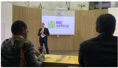
BIC Africa participated in the Ethiopian Diaspora & Startup workshop held online & in Addis Ababa